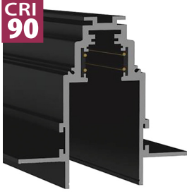
VLDN-CXR35 Recessed Profile DC48V L: 2000 / 3000mm Material: Aluminum Fitting color: Black