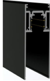
VLDN-CXS35 Surface Profile DC48V L: 2000 / 3000mm Material: Aluminum Fitting color: Black

Simple, fun & easy with magnets and LED modules. The magnetic track system is flexible, precise and let you have the choice of creating your ideal lighting systems that suits your interior designs and needs. Snap in place and connect automatically by magnets. This magnetic system is perfect for retail displays when exchanging and repositioning the lights are now quicker and easier than before.