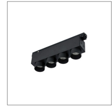
VLDN-T24T-8W-11D Linear Fixed Spot LED Power: 8W 515 Lm 11 Deg, 3000K L176 x W35 x H60mm